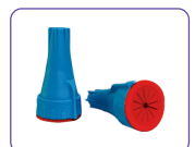
Twist Gel Connector